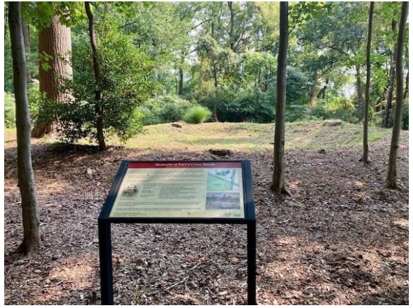
Bull Run CWRT collaborated with the Northern Virginia Community College History Department and the George Mason University to create signage for an important redoubt on the GMU Fairfax campus.

To inspire Civil War Round Table leaders to adapt, adopt, and maintain strategies for sustainability.