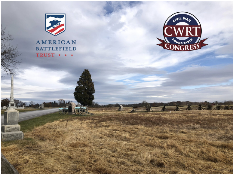
Gettysburg National Military Park

The CWRT Congress reestablished our fundraising partnership with the American Battlefield Trust for Giving Tuesday November 29, 2022. Donations made through the CWRT Congress were split equally between the Congress and the American Battlefield Trust's little-known Interpretation & Restoration Division. That division will utilize our donations for conservation, restoration, and interpretation projects.