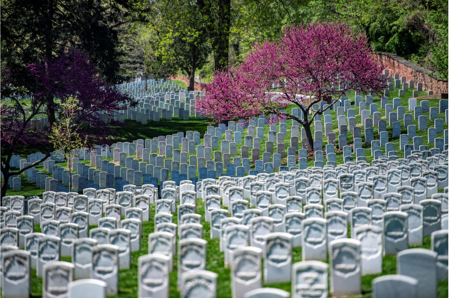
Section 27.

"Peace be to their spirits where they have gone. Honor and sacred remembrance to those who fell...and buried part of our hearts with them... "