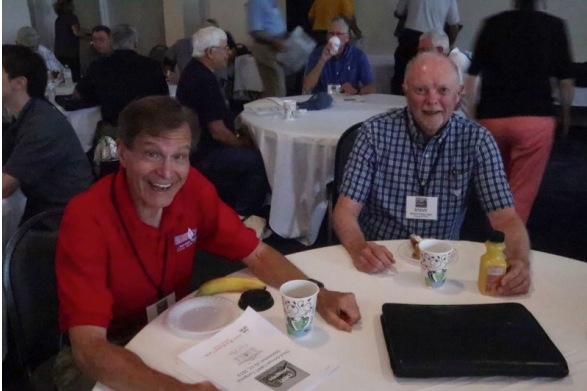
The 2019 CWRT Congress Conference.