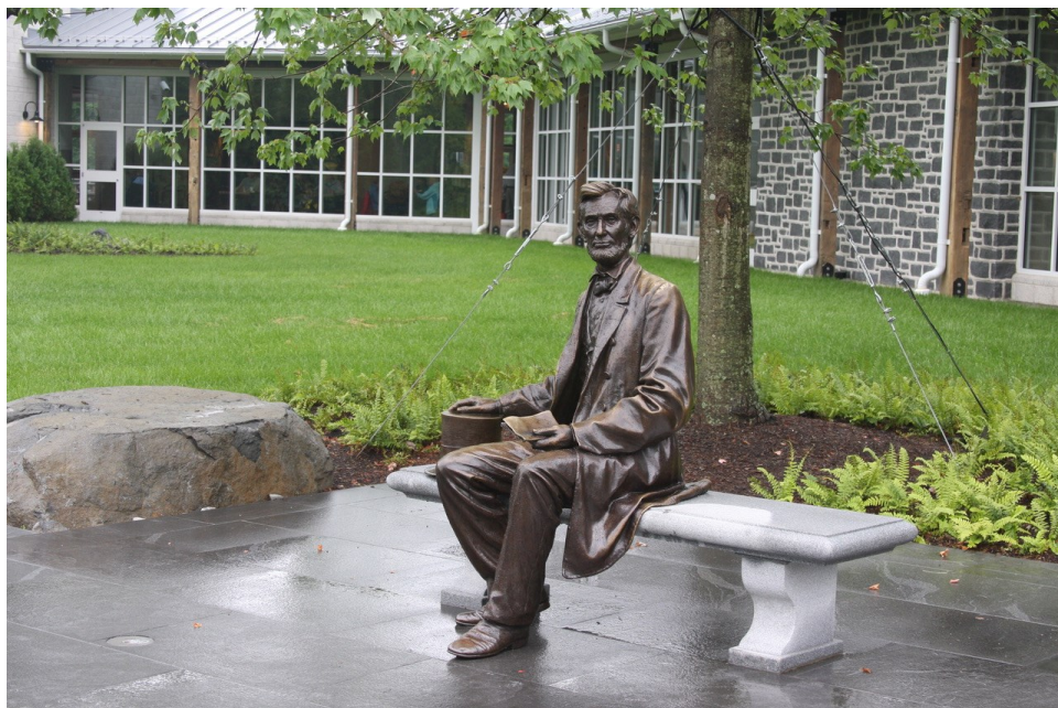
Gettysburg National Military Park Museum and Visitor Center